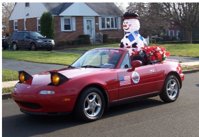
Decked out for the Hatboro Parade