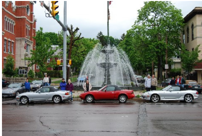
Lunch stop in Bloomsburg on the Corning NY run