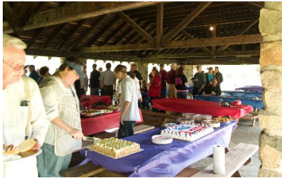
Feasting at the Annual Picnic