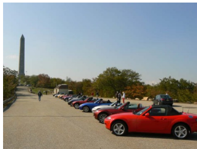
High Point State Park