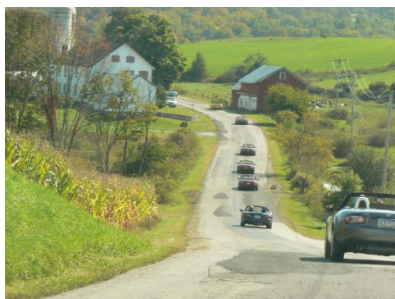
Sussex County Oktoberfest Run