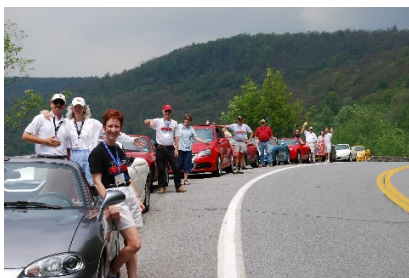
Hawk's Nest / High Point Run