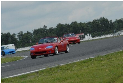
Zoom-Zoomin' on Pocono Raceway

If you are thinking about purchasing a Miata or already have one, be sure to check us out. There is something for everyone in the Delaware Valley Miata Club.