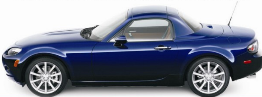
2008 Mazda MX-5 Hardtop

Every new Miata purchase includes a free one year Miata Club Membership.