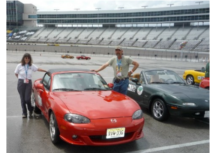
Living it up in Texas!